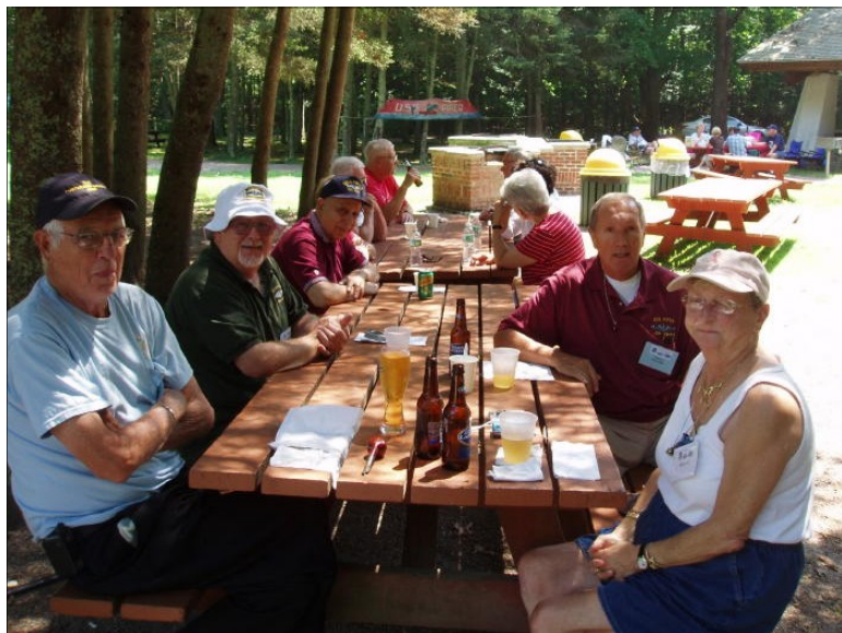
Lobster bake at Admiral Fyfe Park in Stonington, CT