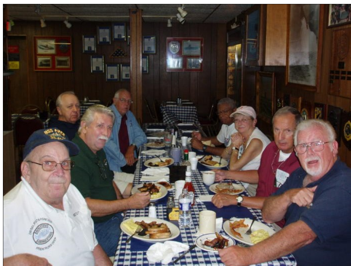
Breakfast at the USSVI Groton Base Clubhouse in Groton, CT